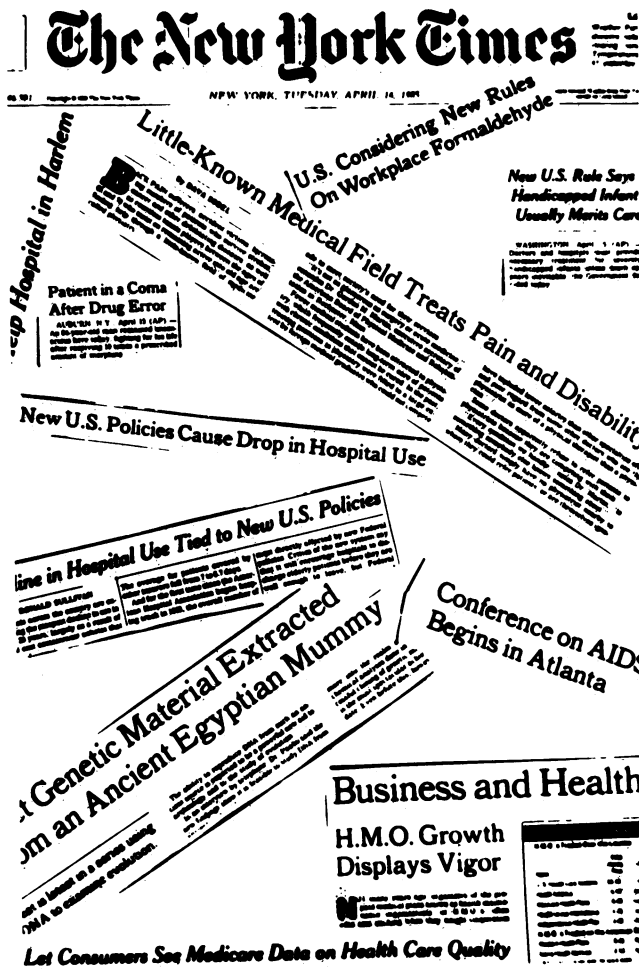
Figure 1. Contemporary issues in medicine as reported in the press.